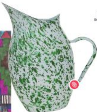
Kewick mottled enamel water pitcher, £28, gardentrading.co.uk