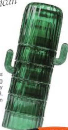
Saguaro cactus set of six stacking glasses by Maiden, £48, trouva.com