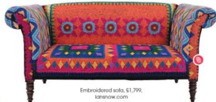
Embroidered sofa, $1,799, lansnow.com