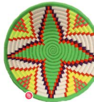
Raffia plate, £35, postcardhome.co.uk