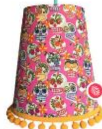
Pompon lampshade in Folklorico skulls, £38, lovefrankie.com