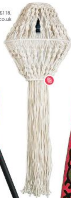
Kaleb easy-fill pendant, $118, darlighting.co.uk