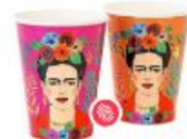
Boho large cups, £4.50 for 12, talkingtables.co.uk