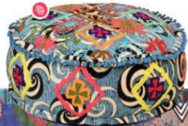
Razlie pouffe, £130, frenchbedroomcompany.co.uk