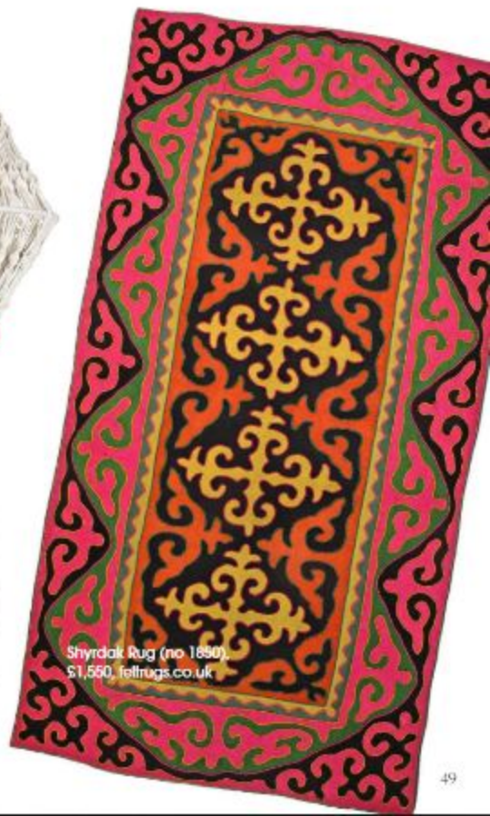
Shyrdak Rug (no 1850), $1,550, foltrugs.co.uk