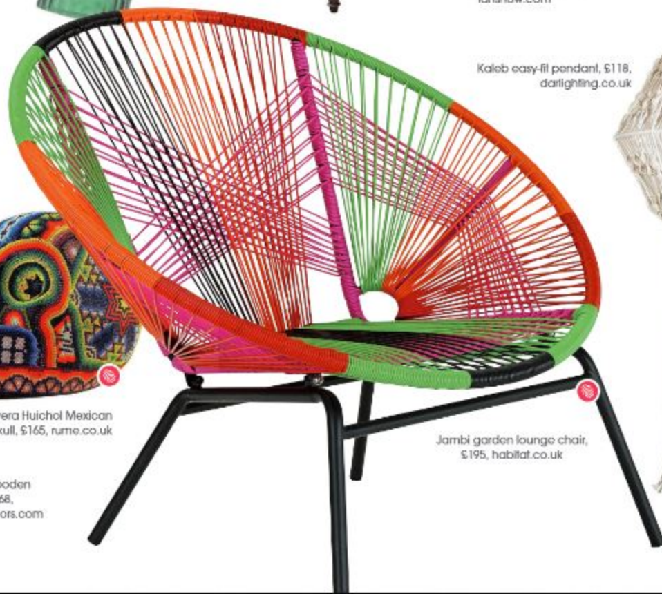
Jambi garden lounge chair, £195, habitat.co.uk