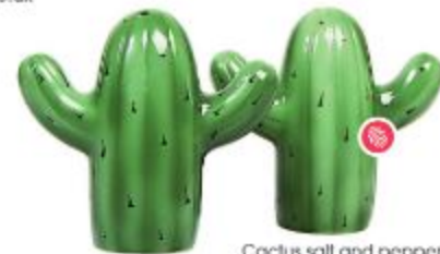
Cactus salt and pepper pots by Klevering, £17.50, printerandtailor.com