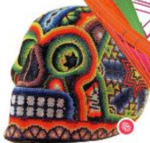
Calavera Huichol Mexican skull, $165, nume.co.uk