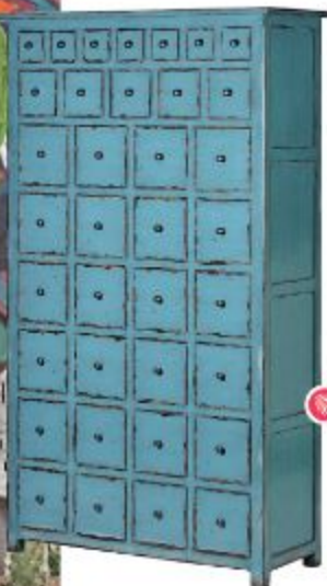
Distressed 36-drawer wooden cabinet, $1,468, outthereinteriors.com