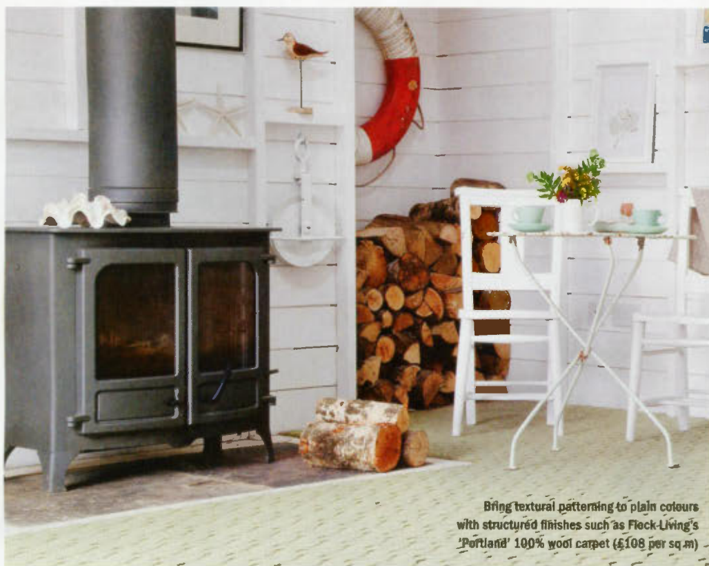
Bring textural patterning to plain colours with structured finishes such as Flock-Living's 'Portland' 100% wool carpet (£108 per sq m)

5 SEEK OUT THE SUBTLE Pattern has a definitive role to play in even the most sober of settings. 'Any design scheme should start from the floor up, so pared-back patterns can be used to guide the rest of the scheme,' says Natalie Littlehales of Brintons. Don't always defer to plains, as subtle patterning is ideal for a more eclectic, mix-and-match aesthetic. Traditional carpet designs encompass all manner of faded florals, birds, butterflies and oriental motifs. While these are most prevalent in bedrooms or living area, such designs readily translate to tiles, with the current plethora of small repeating patterns offering soft vintage styling. Alternatively, stylised botanicals, muted stripes, plaids and even geometrics offer a fresher approach and work in all areas. Anjana Sethia of Flock Living suggests textured carpet as 'an excellent way of introducing pattern, without the need for colour'