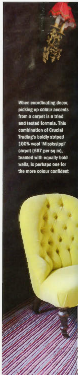
When coordinating decor, picking up colour accents from a carpet is a tried and tested formula. This combination of Crucial Trading's boldly striped 100% wool 'Mississippi' carpet (£67 per sq m), teamed with equally bold walls, is perhaps one for the more colour confident