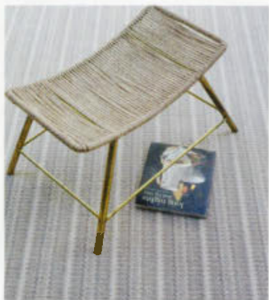
ABOVE 'Cavendish' from Brockway Carpets is available in three colours and six soft muted stripes, including 'Elmwood' (from £35 per sq m)

5 SEEK OUT THE SUBTLE Pattern has a definitive role to play in even the most sober of settings. 'Any design scheme should start from the floor up, so pared-back patterns can be used to guide the rest of the scheme,' says Natalie Littlehales of Brintons. Don't always defer to plains, as subtle patterning is ideal for a more eclectic, mix-and-match aesthetic. Traditional carpet designs encompass all manner of faded florals, birds, butterflies and oriental motifs. While these are most prevalent in bedrooms or living area, such designs readily translate to tiles, with the current plethora of small repeating patterns offering soft vintage styling. Alternatively, stylised botanicals, muted stripes, plaids and even geometrics offer a fresher approach and work in all areas. Anjana Sethia of Flock Living suggests textured carpet as 'an excellent way of introducing pattern, without the need for colour'