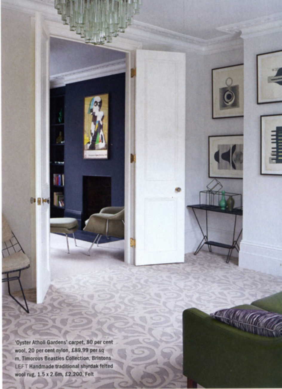
'Oyster Atholl Gardens' carpet, 80 per cent wool, 20 per cent nylon, £89.99 per sq m, Timorous Beasties Collection, Brintons LEFT Handmade traditional shyrdak felted wool rug, 1.5 x 2.6m, £2,200, Felt